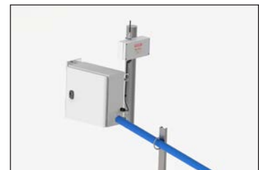
GEO-XW Wire Extensometer mounted within enclosure with WI-SOS 480 Node