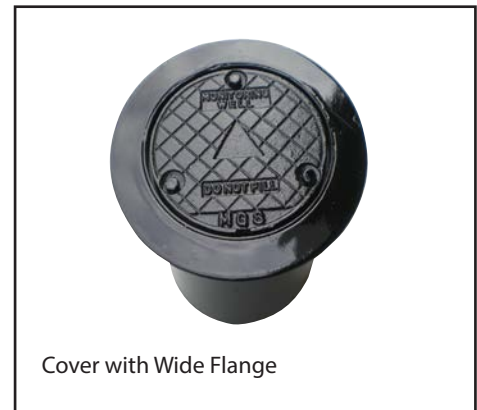
Cover with Wide Flange

They are marked 'Monitoring Well DO NOT FILL' for clear identification and to avoid any unauthorised access.