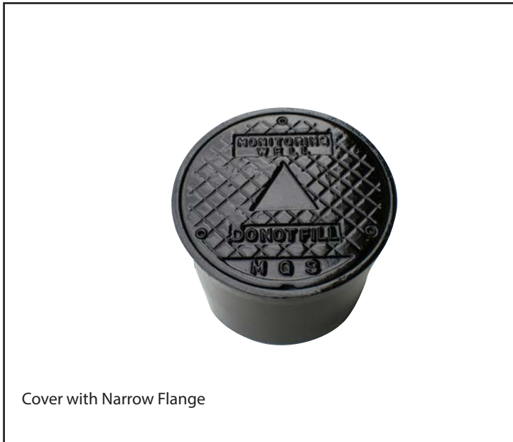
Cover with Narrow Flange